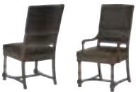
Upholstered Side Chair | 322-541 W 22 D 26-1/4 H 42 in. W 56 D 67 H 107 cm.