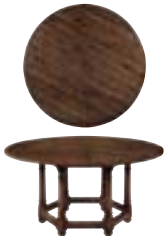
Round Dining Table Table Top (72") | 322-275 Table Top (62") | 322-274 Table Base | 322-273 Diameter 62-72 H 30 in. Diameter 158-183 H 77 cm.