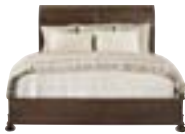
Platform Bed (King) 322-H66 F66 R66 Platform Bed (King) 322-H66B F66B R66B W 84-3/8 D 93-1/4 H 62 in. W 215 D 237 H 158 cm. Also available in Queen and California King sizes. Available in Tobacco and Molasses finishes.