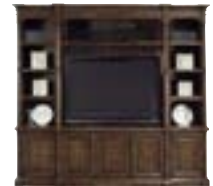
Entertainment Center Left Pier Unit | 322-819 Deck | 322-861 Console | 322-860 Right Pier Unit | 322-818 W 101-3/4 D 21 H 92 in. W 259 D 54 H 234 cm. TV Area: W 52-1/2 D 17 H 52-1/2 in. TV Area: W 134 D 44 H 134 cm.