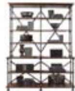
Bookcase Deck | 322-813 Base | 322-812 W 68 D 21-1/2 H 88-1/4 in. W 173 D 55 H 225 cm.