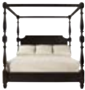
Poster Bed (King) 322-H59B F59B R59B W 84-3/4 D 89 H 60-3/4-90-1/2 in. W 216 D 226 H 155-230 cm. Also available in Queen and California King sizes.