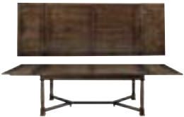
Trestle Table | 322-224 W 84-132 D 46-12 H 30 in. W 214-336 D 117 H 77 cm.